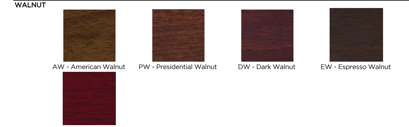
MW - Mahogany Walnut